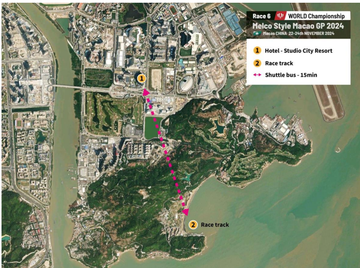
Picture 2 Hotel - Race Venue distance